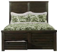
Bedframe Available in Queen & King

The Shelter Bay bedroom set boasts a soothing, yet sophisticated, style with its beautifully distressed finish, special features and slat panel design. This platform storage bed offers footboard storage. While case pieces provide hidden drawers, USB ports and cedar-lined bottom drawers. This collection is not only gorgeous, but also packed with functionality.