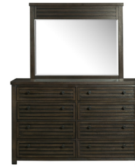
Dresser w/ Mirror